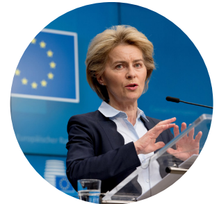
President von der Leyen, State of the Union Address 2020

“Where is the essence of humanity when every single day Roma people are excluded from society and others are held back simply because of the colour of their skin or their religious belief?”