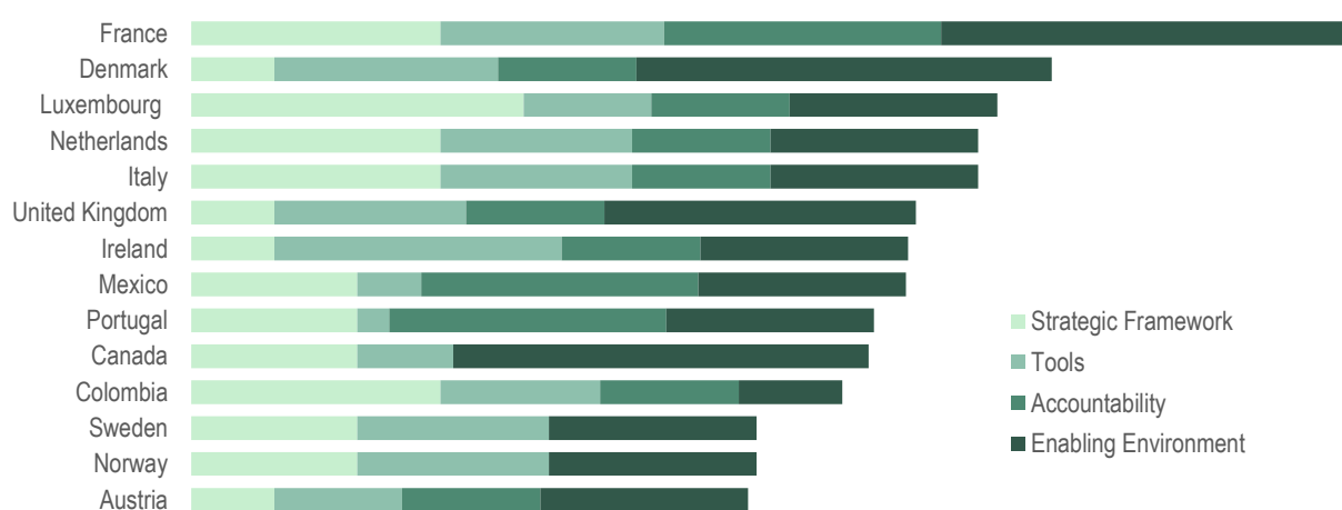
Figure 1. OECD countries practicing green budgeting, composite indicator score