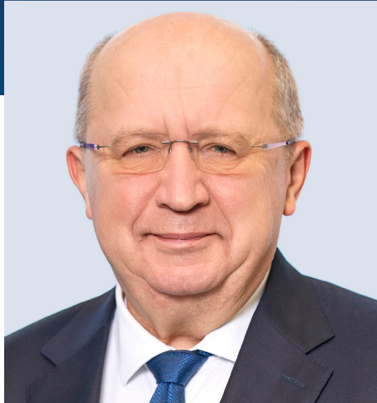
Andrius Kubilius Commissioner for Defence and Space, European Commission

Andrius Kubilius has been European Commissioner for Defence and Space since December 2024. Born on 8 December 1956 in Vilnius, Lithuania, he graduated from the Faculty of Physics at Vilnius State University. Throughout his long-standing public service, Mr Kubilius has held a number of senior political responsibilities at both national and European level. He was actively involved in Lithuania's pro-independence movement and served as Secretary-in-Charge of the pro-independence Reform Movement Sąjūdis from 1990 to 1992. Commissioner Kubilius was a Member of the Seimas of the Republic of Lithuania from 1992 to 2019 and served twice as Prime Minister of Lithuania, from 1999 to 2000 and again from 2008 to 2012. From 2003 to 2015, he was Chairman of the Homeland Union – Lithuanian Christian Democrats. From 2019 until December 2024, Mr Kubilius was a Member of the European Parliament, where he also served as Chair of the European Parliament Delegation to the Euronest Parliamentary Assembly from 2019 to July 2024. Since December 2024, Mr Kubilius has been a Member of the European Commission, with responsibility for Defence and Space.