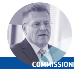
COMMISSIONER : MAROŠ ŠEFCOVIČ