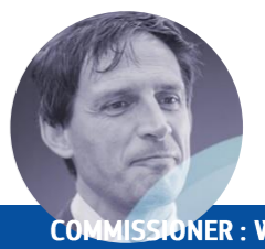
COMMISSIONER : WOPKE HOEKSTRA