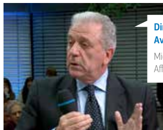
Dimitris Avramopoulos Migration, Home Affairs and Citizenship