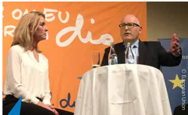
Citizens' Dialogue in Stockholm, Sweden 11 May 2017

Better Regulation, Interinstitutional Relations, the Rule of Law and the Charter of Fundamental Rights