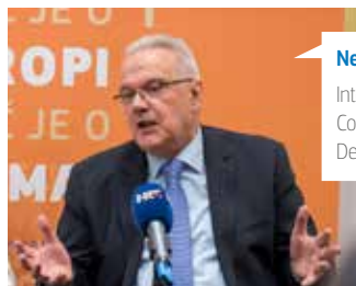
Neven Mimica International Cooperation and Development