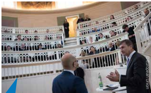
Citizens' Dialogue in Berlin, Germany 10 December 2015