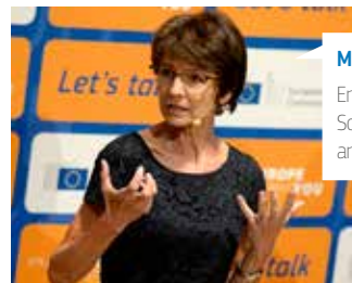
Marianne Thyssen Employment, Social Affairs, Skills and Labour Mobility