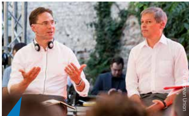
Citizens' Dialogue in Bucharest, Romania 1 September 2016

Jobs, Growth, Investment and Competitiveness