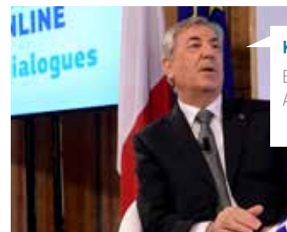
Karmenu Vella Environment, Maritime Affairs and Fisheries