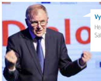
Vytenis Andriukaitis Health and Food Safety