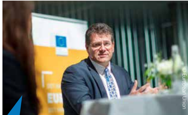
Citizens' Dialogue in Lisbon, Portugal 18 July 2017