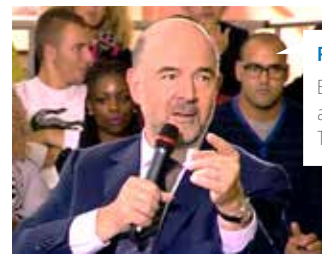
Pierre Moscovici Economic and Financial Affairs, Taxation and Customs