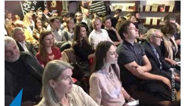
Citizens' Dialogue in Esbjerg, Denmark 1 June 2017