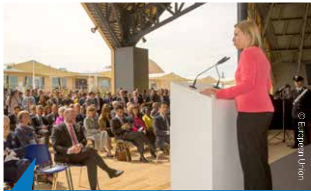
Citizens' Dialogue in Prague, Czech Republic 11 January 2016