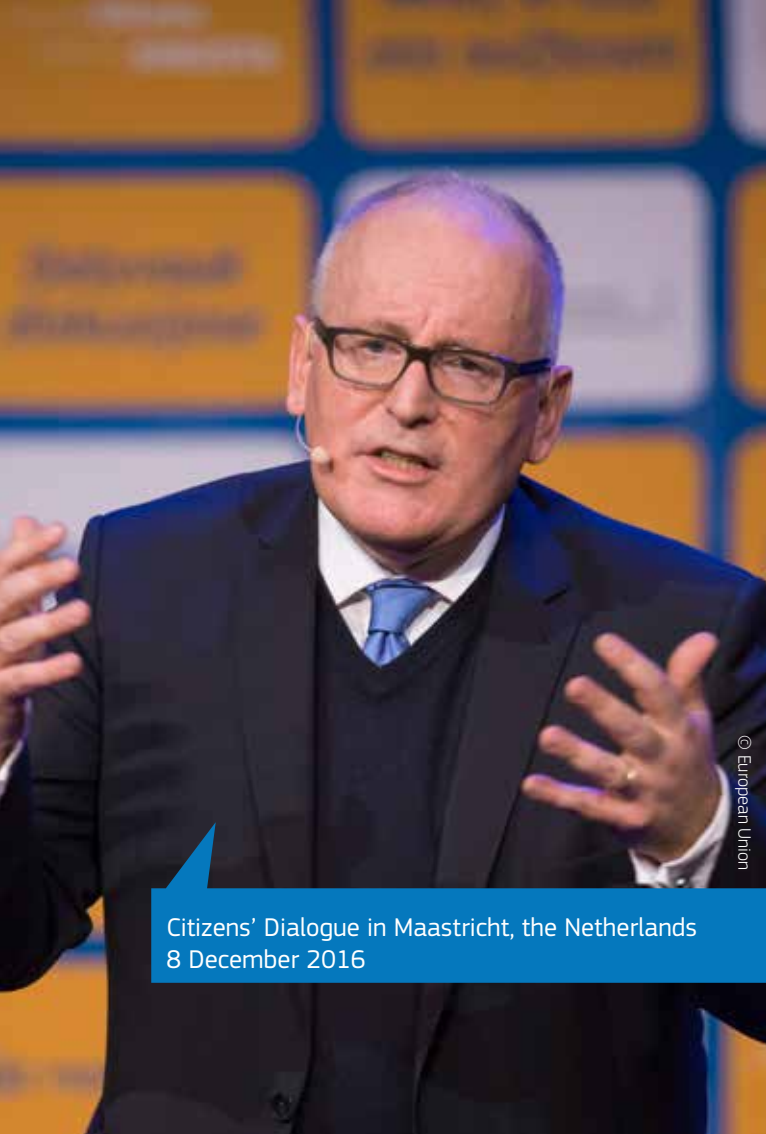
Citizens' Dialogue in Maastricht, the Netherlands 8 December 2016