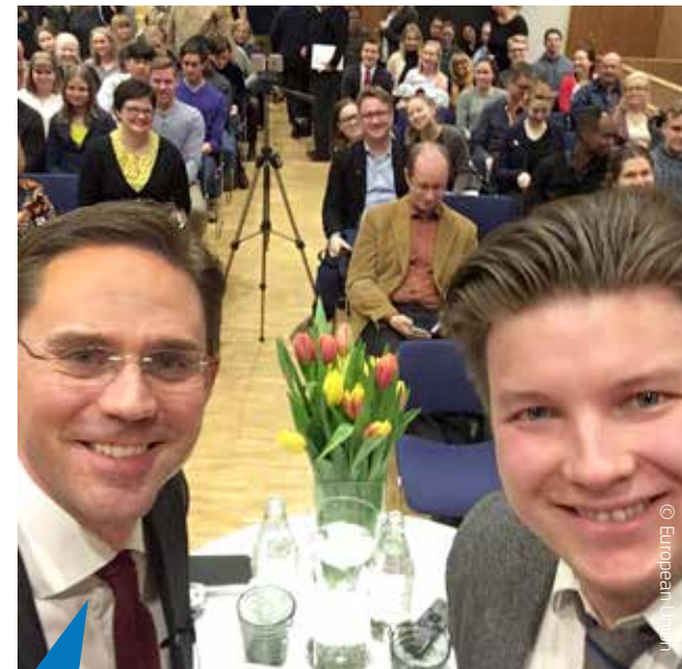
Citizens' Dialogue in Helsinki, Finland 23 March 2017