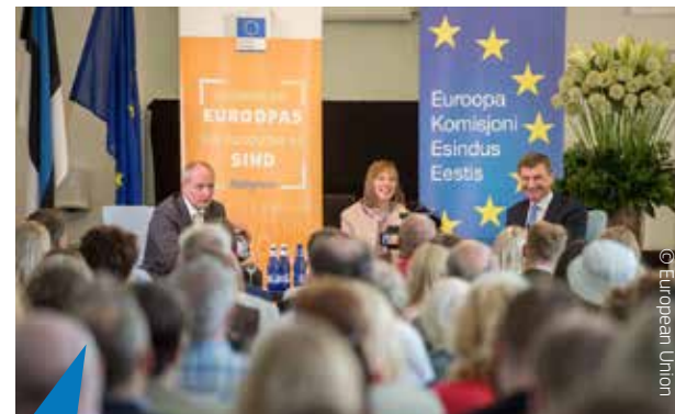
Citizens' Dialogue in Tallinn, Estonia 29 June 2017