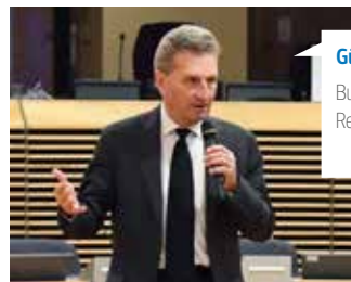
Günther H. Oettinger Budget and Human Resources