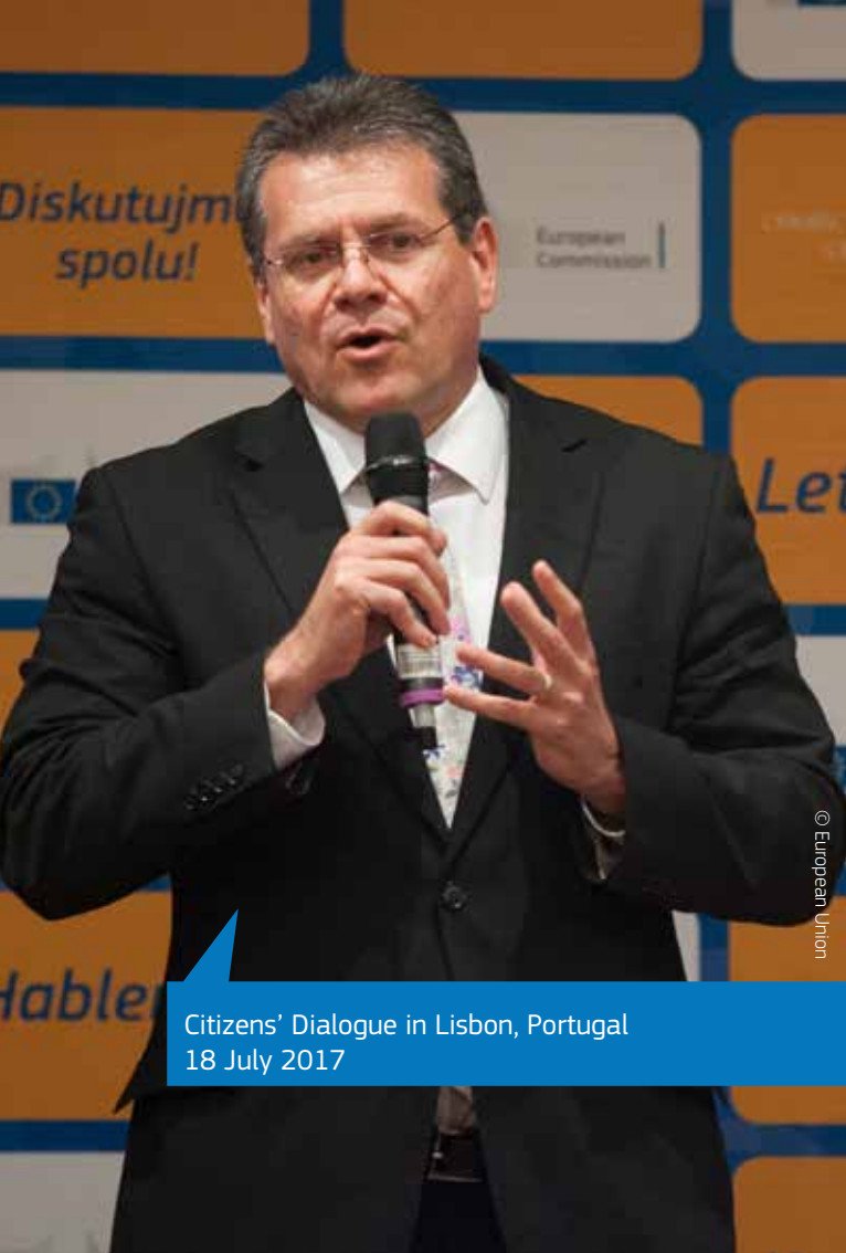
VICE-PRESIDENT Maroš Šefčovič Energy Union