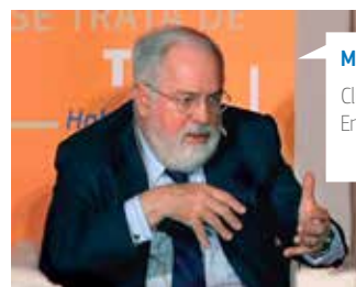
Miguel Arias Cañete Climate Action and Energy