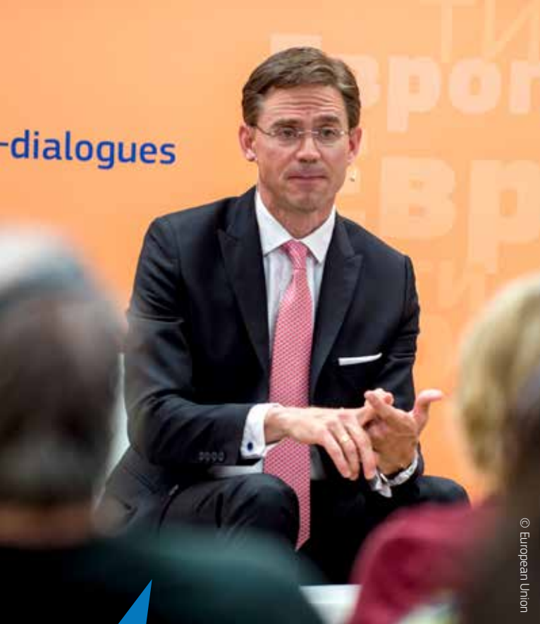
Citizens' Dialogue in Sofia, Bulgaria 21 July 2017