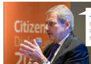
Johannes Hahn European Neighbourhood Policy and Enlargement Negotiations