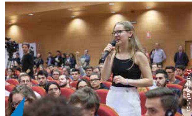
Citizens' Dialogue in Madrid, Spain 31 March 2017