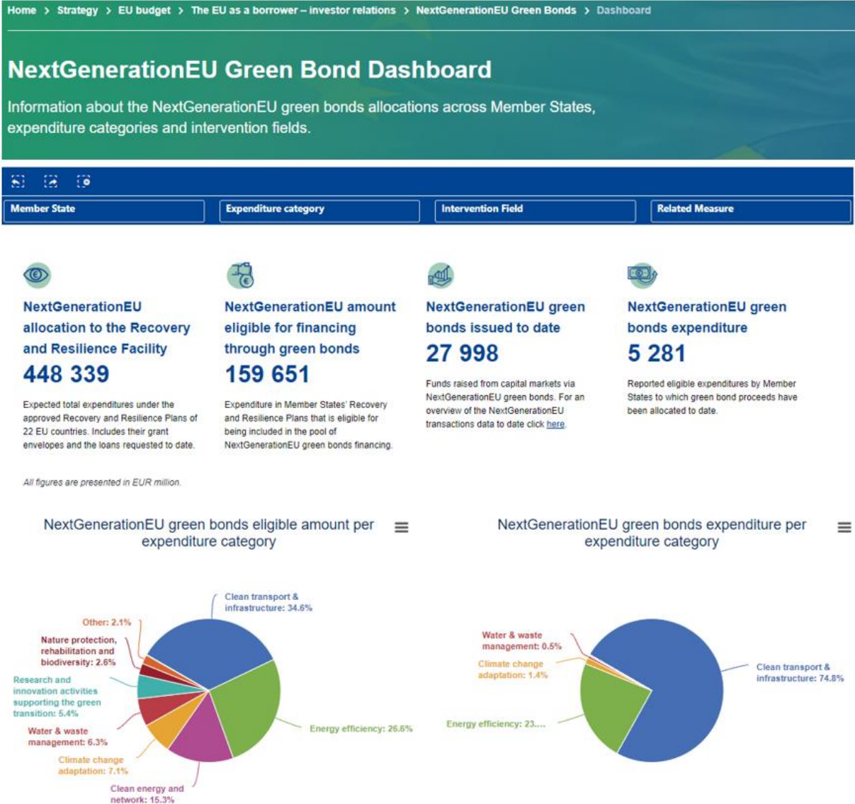
Figure 1: Screenshot of the NextGenerationEU green bond dashboard

The inherent attractiveness of NextGenerationEU green bonds as evidenced by the strong investor demand, reinforced by the high level of transparency around the use of proceeds, provides a strong platform for building the world’s biggest pipeline of green bonds. The NextGenerationEU green bond programme therefore provides a unique opportunity to build a highly liquid green bond curve.