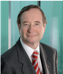
Dr. Christoph Leitl President of the Austrian Federal Economic Chamber Diversity Charter Patron

The full wording is available at www.charta-der-vielfalt.at .