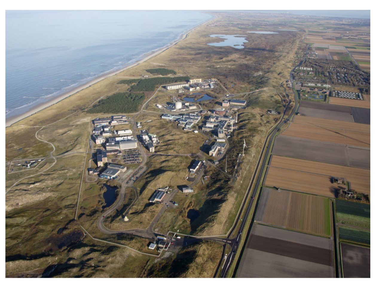
Petten site overview

Projects to improve the campus infrastructure and accessibility are ongoing. These are complemented by programmes to connect the campus with knowledge and educational institutions. Furthermore, plans are progressing to establish a public Experience Centre, a multifunctional communication attraction to be located in the village of Petten (circa 3 km south of the JRC site). The Experience Centre will take visitors