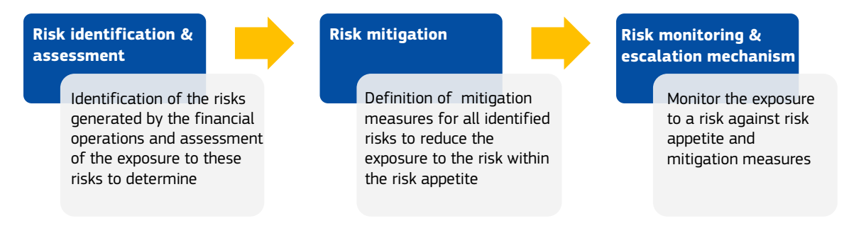
Figure 1. Risk management process