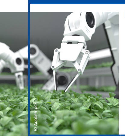
France provided subsidies to 3,370 industrial SMEs and mid-cap companies to acquire fixed assets for new technologies such as robotics. virtual reality. highperformance computing, digitally controlled production and artificial intelligence.

Italy provided grants to more than 5,200 SMEs, to support their internationalisation (e.g. to access foreign markets) and development of e-commerce.