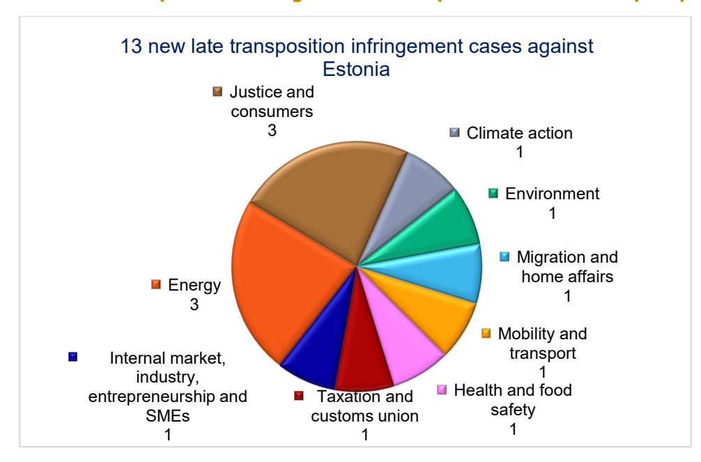
New late transposition infringement cases opened in 2019: main policy areas