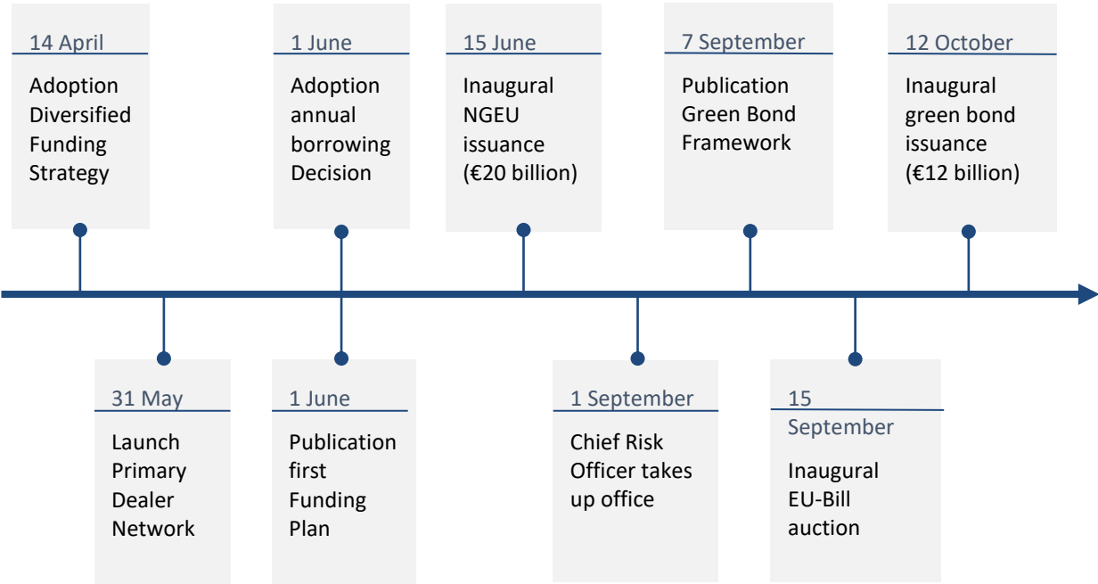
Figure 1: Key steps in setting up the NextGenerationEU (NGEU) funding operations

Achieving these milestones required a number of key enablers, including: