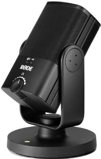
Unidirectional USB Desktop Microphone 125Hz - 15000Hz