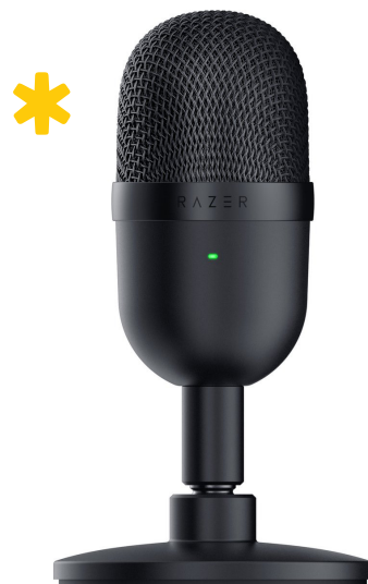
Razer Seiren Mini