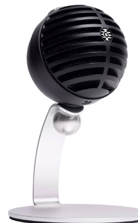
Shure MV5 using neutral setting