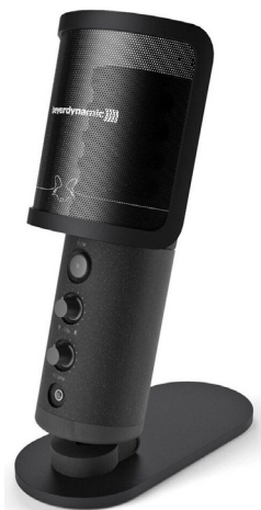
Beyerdynamic FOX using high-gain function