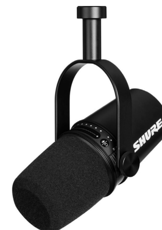
Shure MV7 + a stand / tripod

* Equipped with the best accessories (stand, shock mount) and very user-friendly (pattern switch)