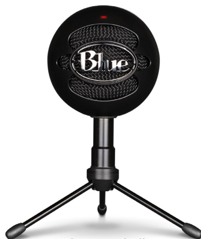
Blue Snowball using cardioid pattern