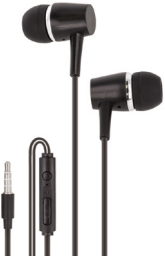
Wired earphones with microphone