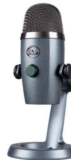
Blue Yeti Nano using cardioid pattern