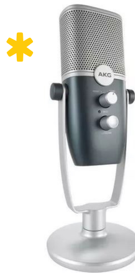
AKG ARA using cardioid pattern