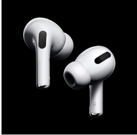
Wireless blue tooth earplugs