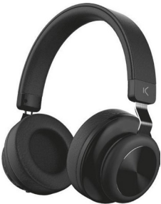
Wireless bluetooth headphones