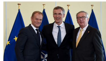
(NATO) Summit, Warsaw 08-09/07/2016

On 8 July 2016, Presidents Juncker and Tusk and NATO Secretary General Stoltenberg signed a Joint Declaration to give new impetus and substance to the EU - NATO strategic partnership , outlining seven concrete areas to enhance cooperation . Cooperation has become the established norm as a direct follow-up to the new level of ambition outlined in the Joint Declaration.