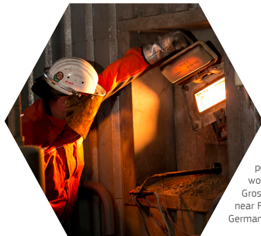
Staudinger black coal power plant, worker, in Grosskrotzenburg, near Frankfurt, Germany