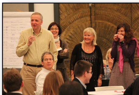
Commission's Education and Culture DG is working on citizenship education, we are liaising with them on this. Similarly, resources are available from DG Research for many topics. We propose to focus on topics

In order to move the conversations from the small tables into the room and make our collective findings visible, the hosting team collected and clustered the opportunities and challenges as they were spoken from the tables out into the room. Succinctly, this is what we saw: