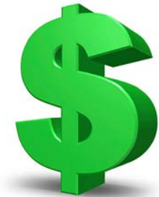
Feasibility (technical & economical)