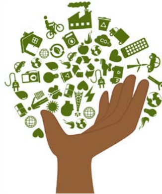
Impact on environment