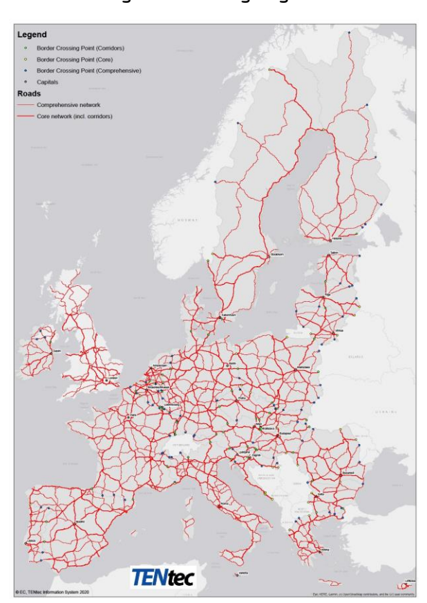
TEN-T network including border crossing points

The first Connecting Europe Facility (CEF) transport work programme, covering the period 2021-2023, will continue supporting of the completion an efficient, interconnected and multimodal TEN-T for smart, interoperable, sustainable, inclusive, accessible, safe and secure mobility. CEF will focus on the most climate and energy efficient modes of transport, in particular rail, and support the large-scale deployment of alternative fuel infrastructure contributing to the Union's decarbonisation targets. CEF will address cross-border and missing links, including actions relating to both maritime and inland ports, urban nodes, multimodal platforms amongst others.