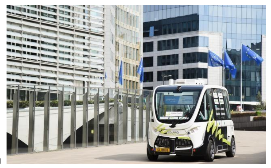
An autonomous e-bus

delays, or the location of vehicles and cargo will help our transport sector to optimise freight and passenger operations, cut congestion and waiting times. and ultimately reduce fuel use and emissions. For that, we will work on a framework that ensures the protection of sensitive data as well as defining standards of interoperability and