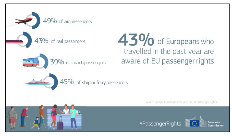
Awareness on EU passenger rights

revisions of the rail and air passenger rights Regulations, and depending on the outcome of the evaluations of the Regulations on waterborne and bus and coach passenger rights and of the Regulation on rights of persons with disabilities and with