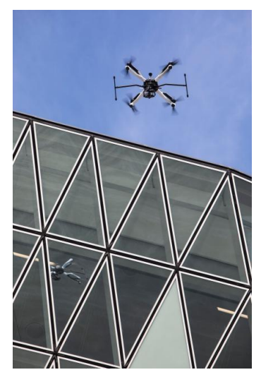
A drone in Antwerp port

As regards drones , we will continue to develop the regulatory framework in order to allow a wider and more automated use of drones, not only for the transport of goods, but also as a solution for urban air mobility challenges.