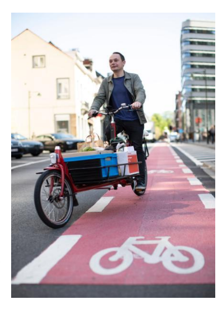
Urban mobility – riding a cargo bike

We will also work closely with national, regional and local authorities and other stakeholders to promote and strengthen clean public and collective transport interconnected with active mobility (walking, cycling) as the backbone of urban mobility . We will encourage all stakeholders involved to more systematically