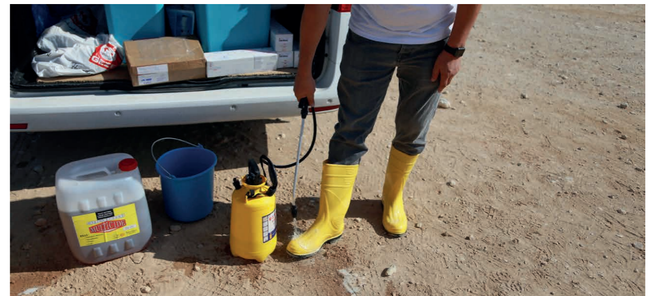
Farmers take part in practical training sessions on preventing the spread of diseases

The team established both a standardised procedure and created a database of farm and animal identification, animal movement data, vaccination/health records, as well as laboratory test results.