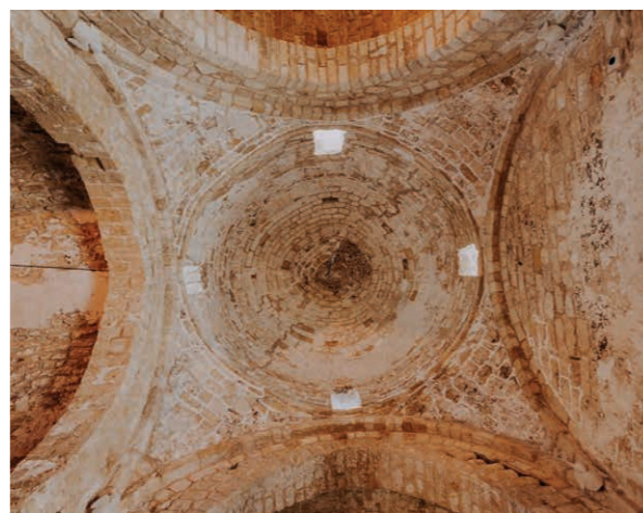
Archangelos Michael Church

The TCCH marked the completion of the restoration with a bi-communal opening ceremony – members and leaders of the Turkish Cypriot and Greek Cypriot communities came together at the church to celebrate the completion of the conservation project, and honour the joint work and mutual trust this joint project represents.