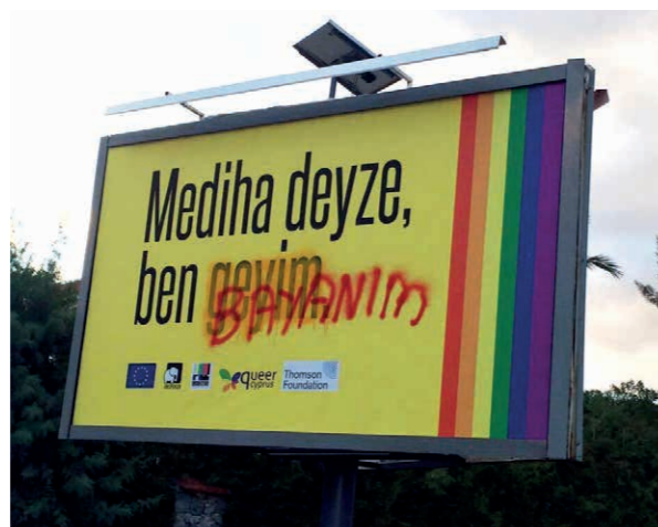
Billboard campaign to encourage discussion around LGBTI rights