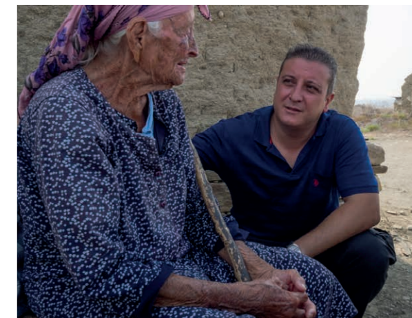
A member of the CMP team speaks with a witness.