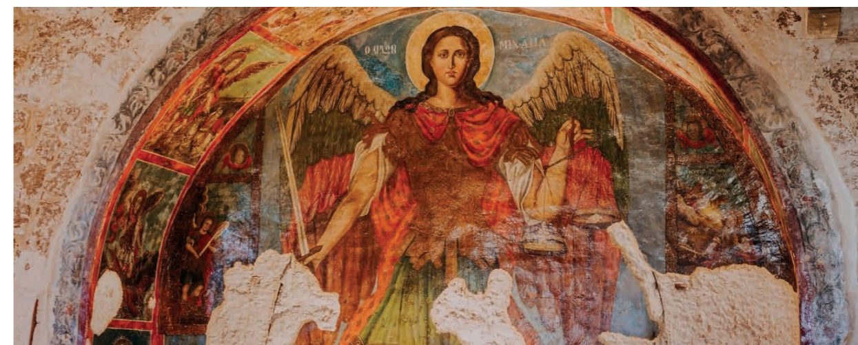
Archangelos Michael Church