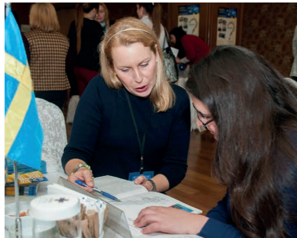
A Turkish Cypriot student learns about study opportunities in Sweden on Europe Day

Previous alumni are encouraged to stay in touch and are invited to share their success at events. The presence of an active alumni network doesn't just help others who might be thinking of applying, it also showcases the diverse range of opportunities on offer and the positive impact that the EU Scholarship Programme is having on the lives of Turkish Cypriots.