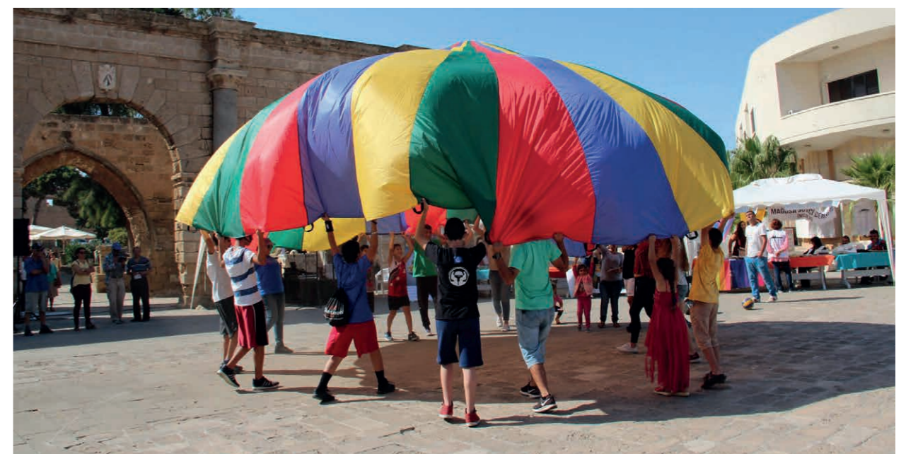
Members of PeacePlayers International, a bi-communal youth sports organisation, play a game at the Open Door Festival.

Posters were used to publicise the events, which took place in different locations across the Turkish Cypriot community