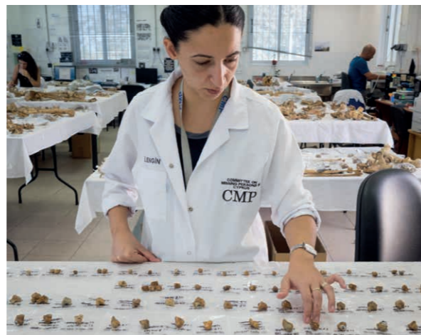
The bi-communal team examines recorded remains at the CMP laboratory © UNDP Photos/ Nick Danziger.

If the CMP is able to give some closure to the deaths of loved ones, there is less suspicion and fewer reasons to be captivated by impossible questions about the past. As the CMP Members say, the violence of the past “leaves a scar, once the person is buried, in dignity, it closes the wound. It leaves a scar that will always stay there, but the wound is closed for good.”